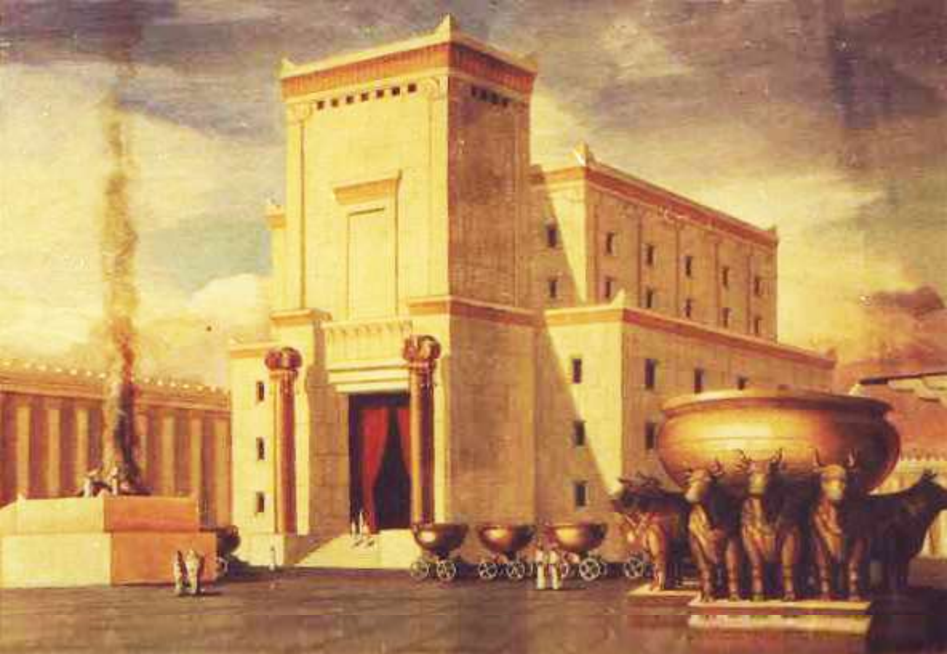
Solomon built a house for the Lord