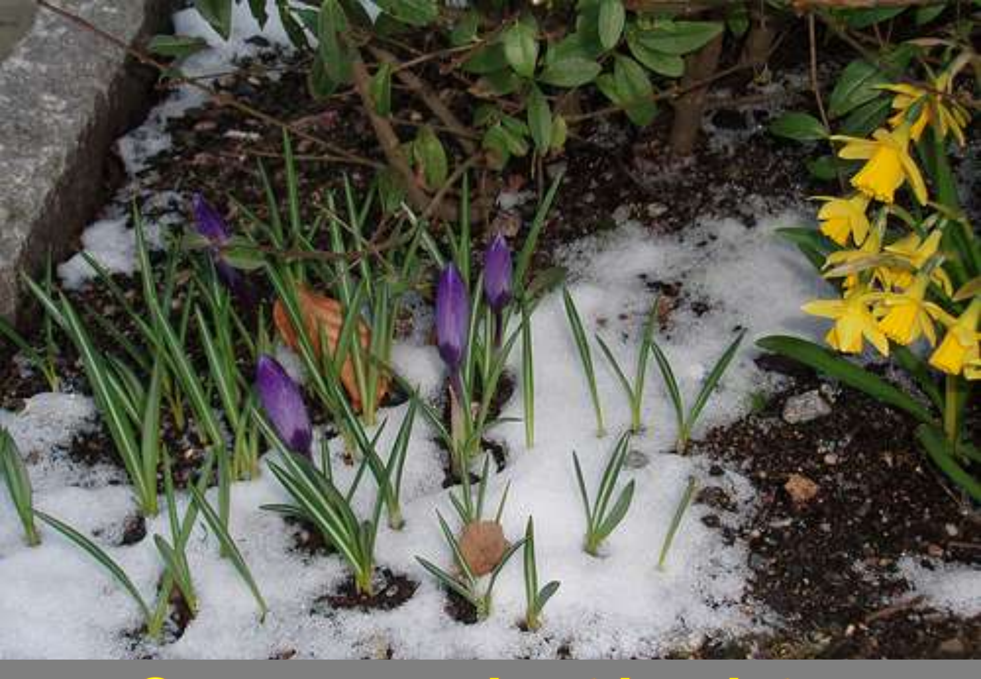
Grace grows best in winter