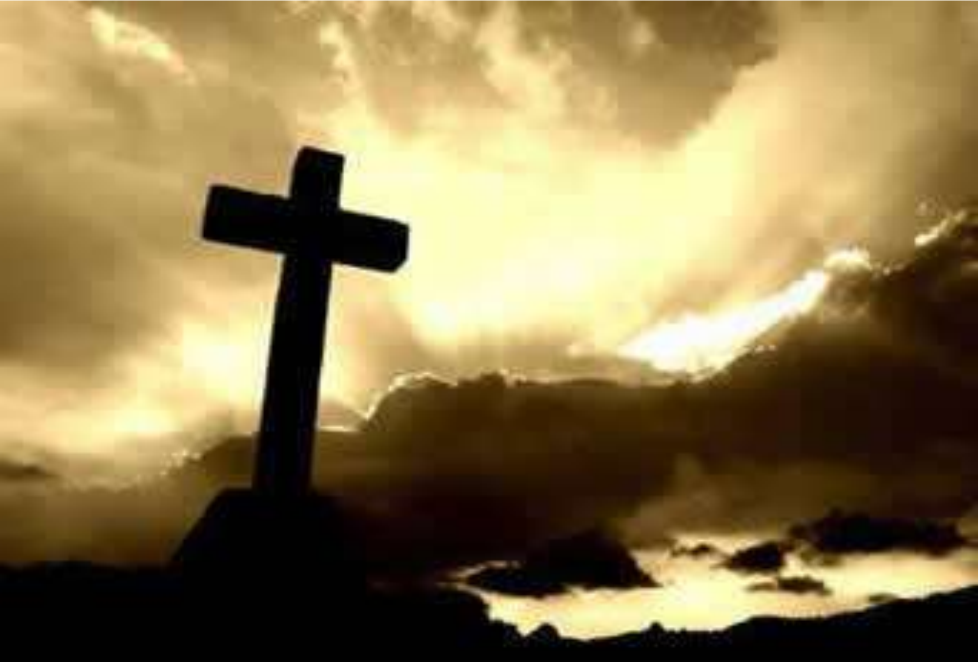
Even in Judgment, God is Merciful